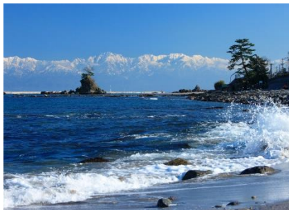
The Tateyama Mountain Range rising above Toyama Bay